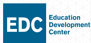
Photo credits: Cover, p.3: Paolo Patrino; p. 2-4: Burt Granofsky; p. 3: Chris Leones. © 2019 Education Development Center, Inc.

EDC 43 Foundry Avenue, Waltham, MA 02453 edc.org Phone: 617-969-7100